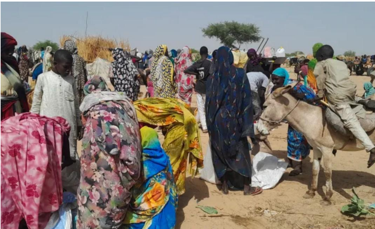
(Sudanese refugees who fled the fighting waiting for food packages distributed by the World Food Programme (WFP) in Sudan-Chad border.)